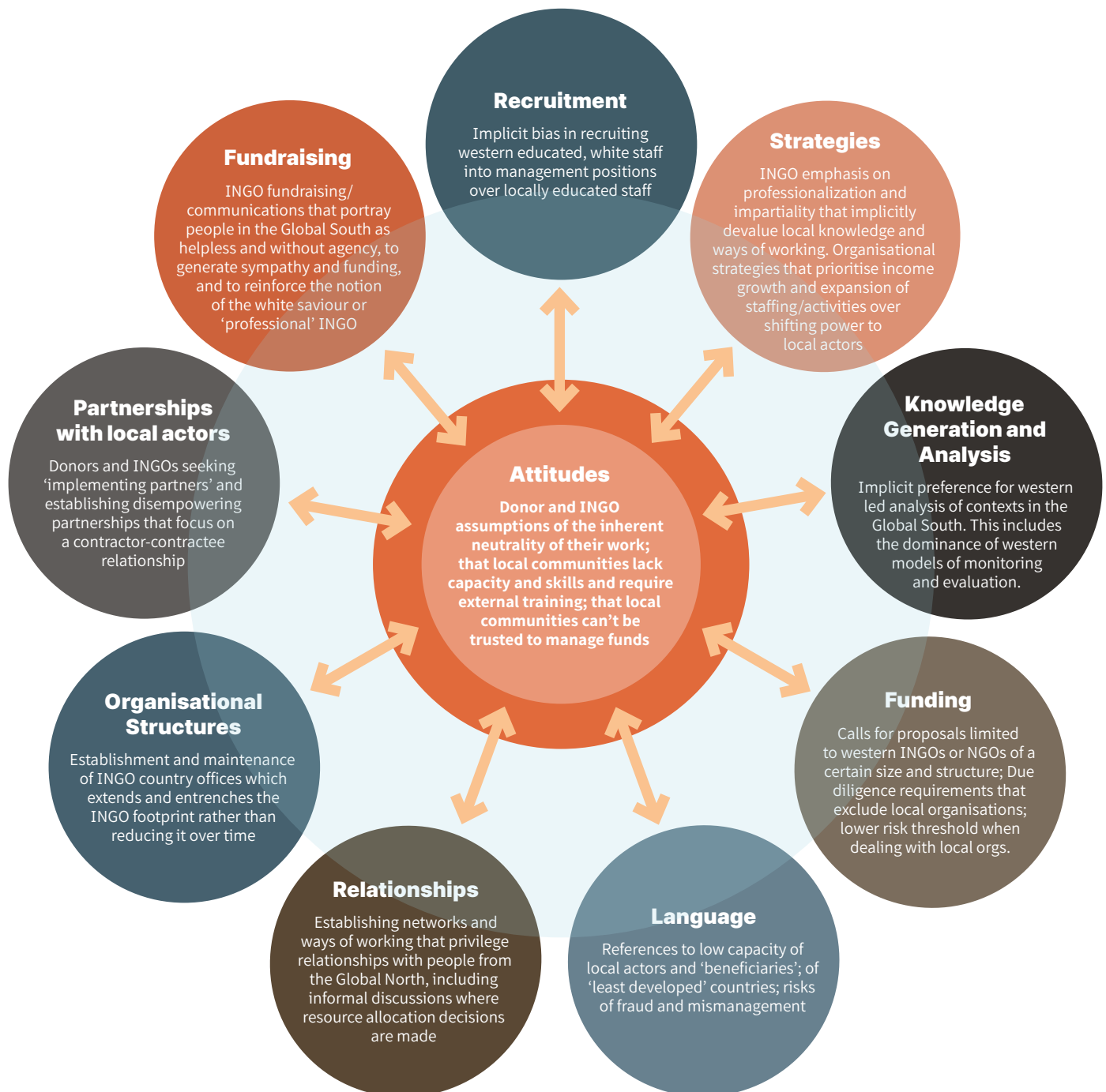
Diagram How structural racism shows up in the sector